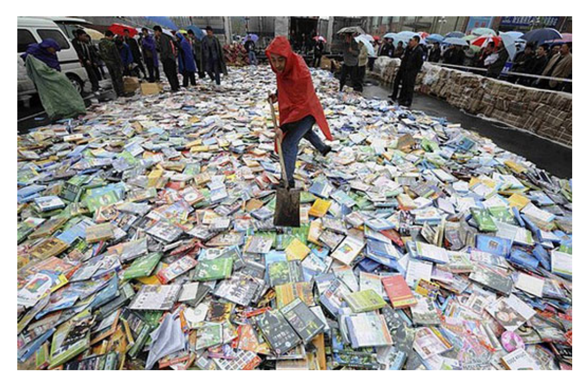
Shoveling pirated DVDs in Taiyuan, Shanxi province, China, April 20, 2008.

capitalism. Poor images are dragged around the globe as commodities or their effigies, as gifts or as bounty. They spread pleasure or death threats, conspiracy theories or bootlegs, resistance or stultification. Poor images show the rare, the obvious, and the unbelievable—that is, if we can still manage to decipher it.