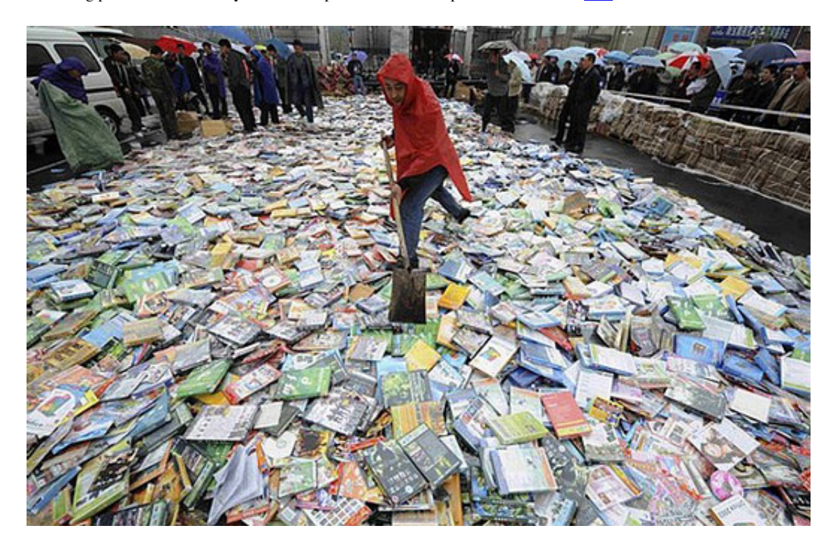
Shoveling pirated DVDs in Taiyuan, Shanxi province, China, April 20, 2008.