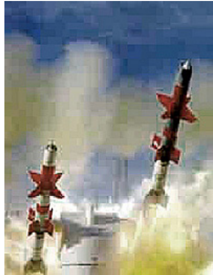
into the swirl of permanent capitalist deterritorialization. 13 The history of conceptual art describes this dematerialization of the art object first as a resistant move against the fetish value of visibility. Then, however, the dematerialized art object turns out to be perfectly adapted to the semioticization of capital, and thus to the conceptual turn of capitalism. 14 In a way, the poor image is subject to a similar tension. On the one hand, it operates against the fetish value of high resolution. On the other hand, this is precisely why it also ends up being perfectly integrated into an information capitalism thriving on compressed attention spans, on impression rather than immersion, on intensity rather than contemplation, on previews rather than screenings.